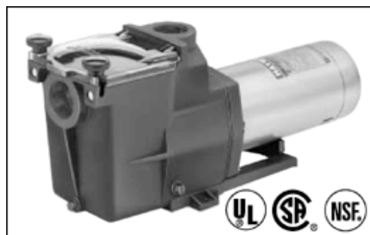
SP2610X15 1 1/2 H.P. Super Pump.

Efficient. Dependable. Proven. The Super Pump has all the quality features you expect from Hayward. For replacement or new pool installations, the Super Pump sets the standard of excellence and value.